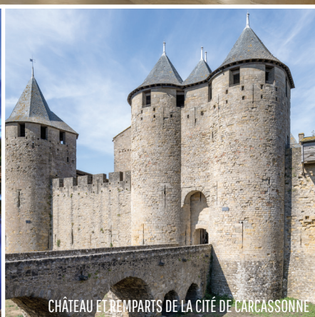
CHÂTEAU ET REMPARTS DE LA CITÉ DE CARCASSONNE