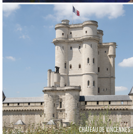
CHÂTEAU DE VINCENNES